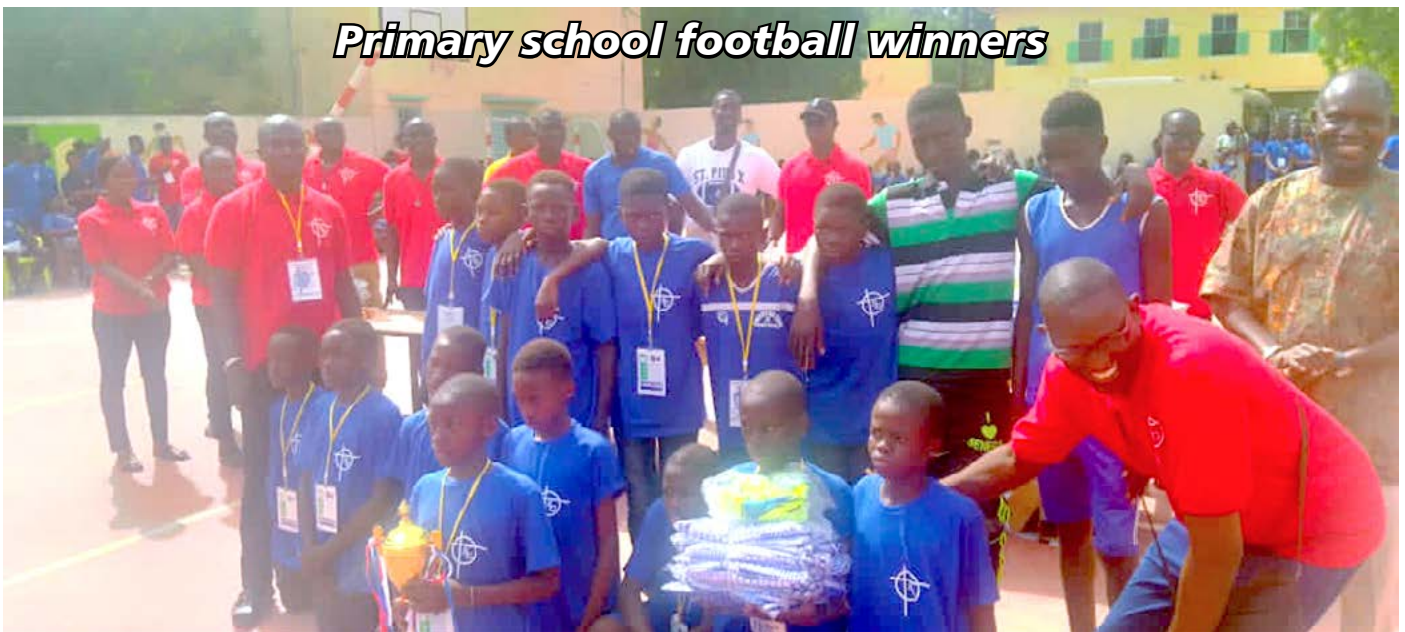
Primary school football winners