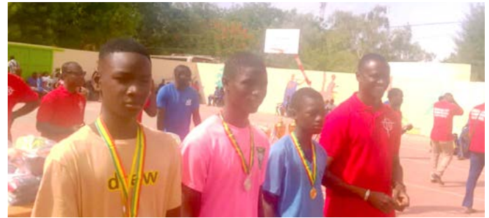
Triple jump men Winners' Podium

Middle School boys competed in football, sprint, and triple jump, while girls faced each other in handball, relay, sprint, and triple jump.