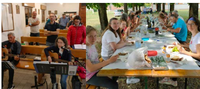
The prayer group "Regina della Pace" has its regular biweekly prayer meetings and recently they arranged a picnic at Ca' Florens with their children. They had