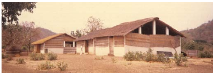
In Salémata, the building of the Agricultural and development training center was made possible by donations from Misereor, a charity German charity run by the Catholic Church.