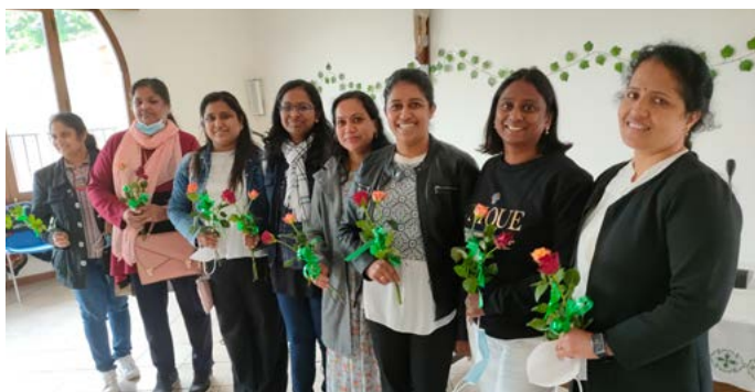
The Indian Catholic Syro-Malabar community has its regular Holy Mass celebration in our Institute. They also had celebrated the International Mothers' Day.