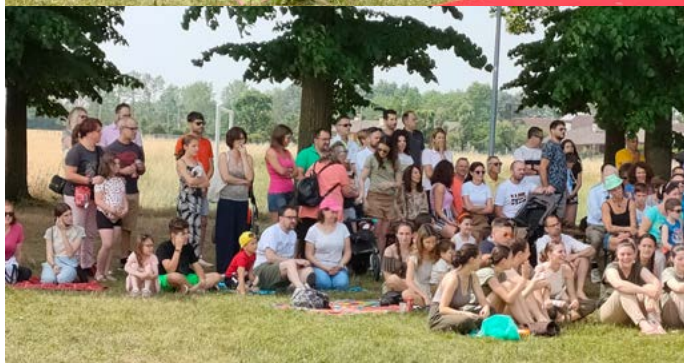
On Saturday 4 and Sunday 5 June we had an annual closing ceremony of about 400 dancing students. These were really marvellous days of dancing for students, their teachers and their parents. The programme was conducted outside in the meadows and the spectacular avenue of limes trees (tigli).