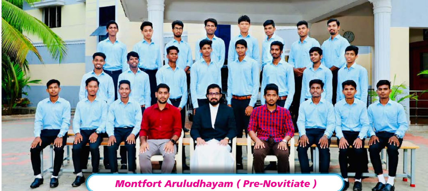
Montfort Aruludhayam ( Pre-Novitiate )

W e are very much excited and privileged to describe the events that occurred in the month of April, at Aruludhayam.