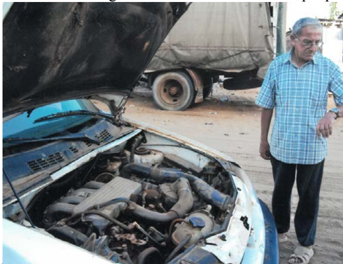
... broken down car in Malika... it takes a little time to wait for the repair... Patience is required!!!

The attitude of the young people toward the mission and their unreadiness to collaborate reflected Sékou Touré's 35 years of Marxist dictatorship: mistrust, opposition to anything foreign, and certain laziness. The number of our students decreased going from 15 to 7. We supported the 7 students helping them to resettle in the village working as farmers and carpenters. Our community was reduced to 3 Brothers: two Senegalese and myself. We enjoyed neither running water, TV nor telephone. We had only a solar panel to lighten the house!