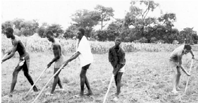
In Bambey, Senegal, the young people of our training center had a slogan they used to chant while working: "joy and songs".

mission "not only as a priority but an extreme urgency for Africa, the training of young people in agricultural development". This was a "turning point" for me! Bro. Gustave, the then-District Superior, suggested that I joined the mission after appropriate training.