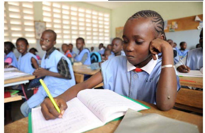
School children in Malika