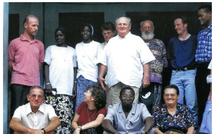
The Parish apostolic teams of Salémata, Ourous and Koundara