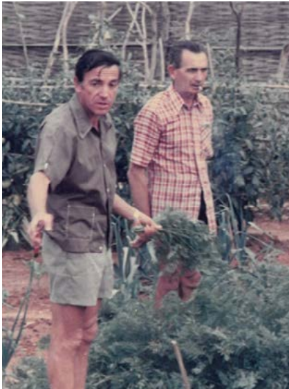
In Salémata, transportation of water from the school garden!

The agricultural training was also conducted in about 20 villages. I was in charge of open-field agriculture during the rainy season. We worked with the means and tools that came at hand including equipped carts with brakes, which were very useful in this hilly country. We utilized different methods such as oxen-