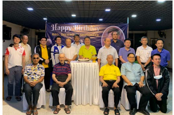
Commemorating the Joyful Birthday of Our Provincial Superior